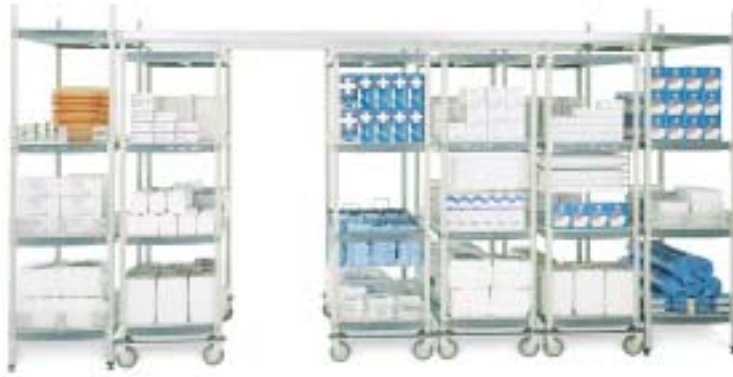
MetroMax® Top Track™ Storage System