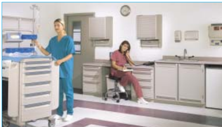
Starsys™ WorkCenter System

For more information, call 800-433-2232. www.metro.com