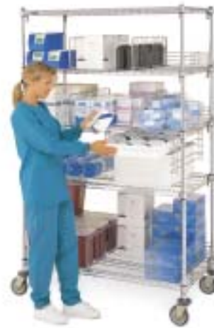
Super Adjustable Super Erecta® Shelving System