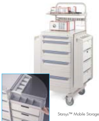
Starsys™ Mobile Storage

HUMAN ENGINEERED SHELVING, CARTS AND WORKCENTERS.